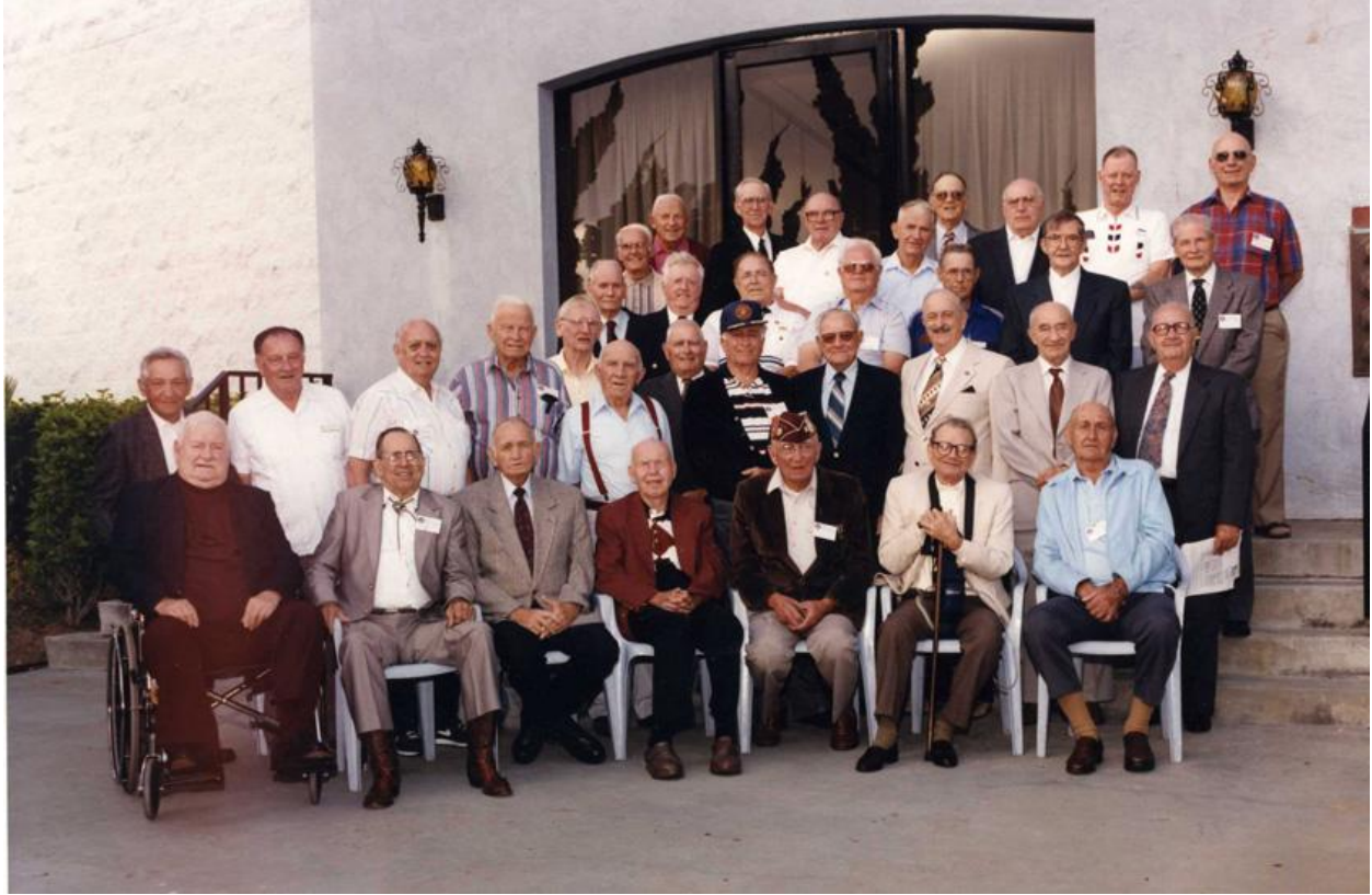
Wake Island Defenders- 1996 Reunion, San Diego