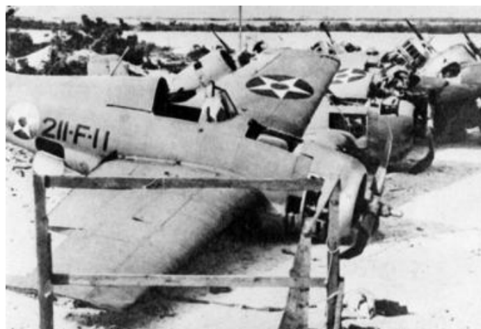
Destroyed F4F Wildcats on Wake Island, December 1941.

By the 21st, the last of the Wildcats had been destroyed in dogfights over the atoll. With nothing left to fly, Putnam’s aviators were assigned duty as riflemen. Japanese airplanes now roamed over the island at will, pounding American positions in preparation for a renewed attempt to seize the atoll.