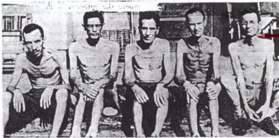
Wake Island POWs